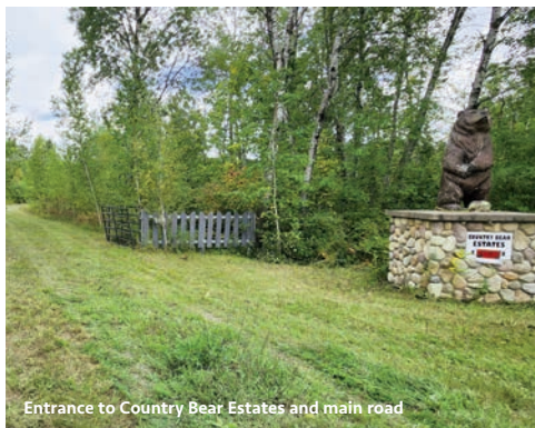
Entrance to Country Bear Estates and main road

Subscribe for free email notifications of upcoming auctions at: cwsmarketing.com