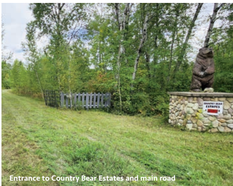
Entrance to Country Bear Estates and main road