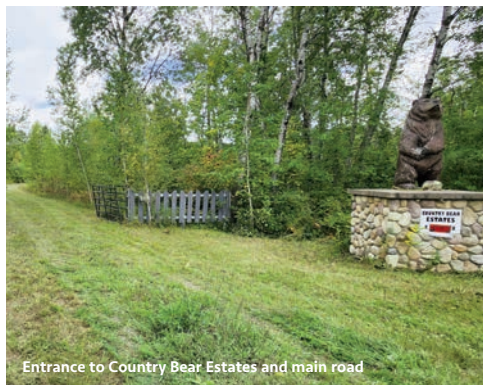
Entrance to Country Bear Estates and main road

Subscribe for free email notifications of upcoming auctions at: cwsmarketing.com