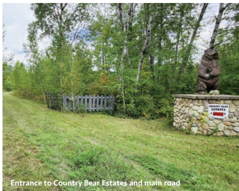
Entrance to Country Bear Estates and main road

Subscribe for free email notifications of upcoming auctions at: cwsmarketing.com